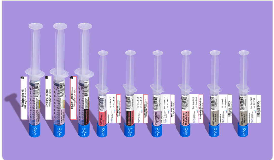
(Only select products of our full Kit Check portfolio displayed)